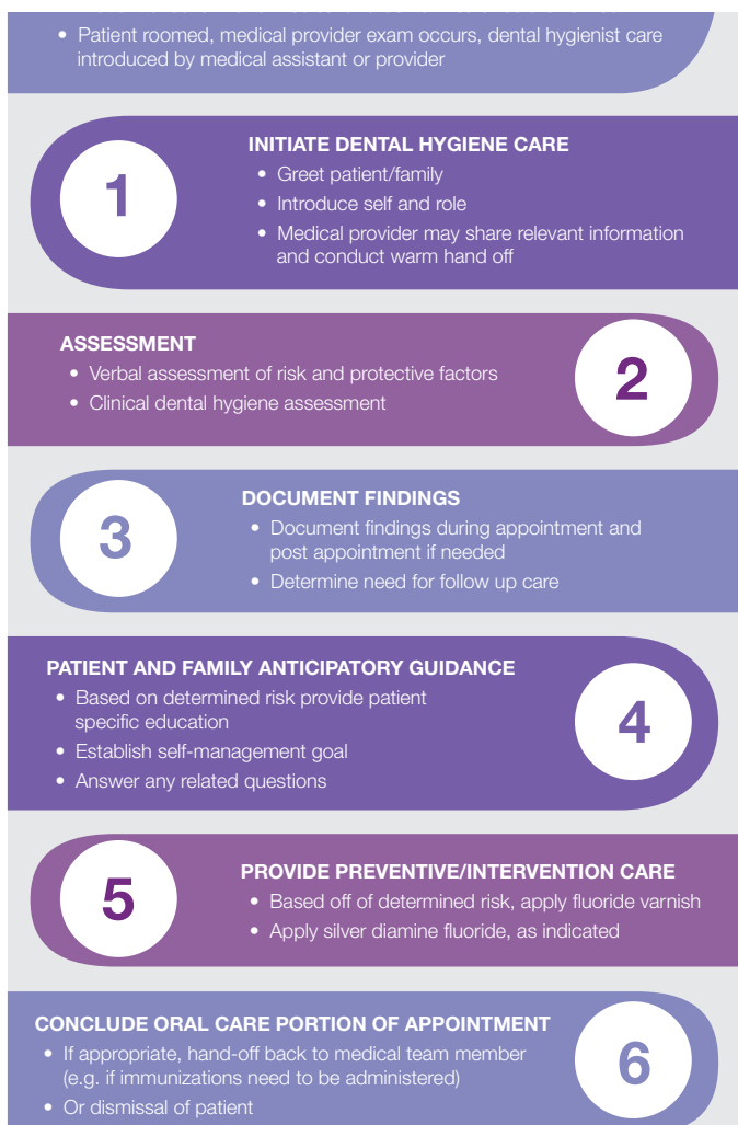
Figure 3. Typical integrated dental hygienist's work flow

variety of reasons. Four clinics began implementation with their pediatric patients and then expanded to their prenatal patients. Over 15,000 patient visits to a medical provider included oral health services provided by a DH in Wisconsin health systems and health centers from 2019 - 2023. Some challenges have been encountered in capturing process and outcome measures consistently across the range of health systems and centers due to COVID-19 data prioritization and limitations within certain electronic health record reporting capabilities. Efforts are being made to improve the efficiency