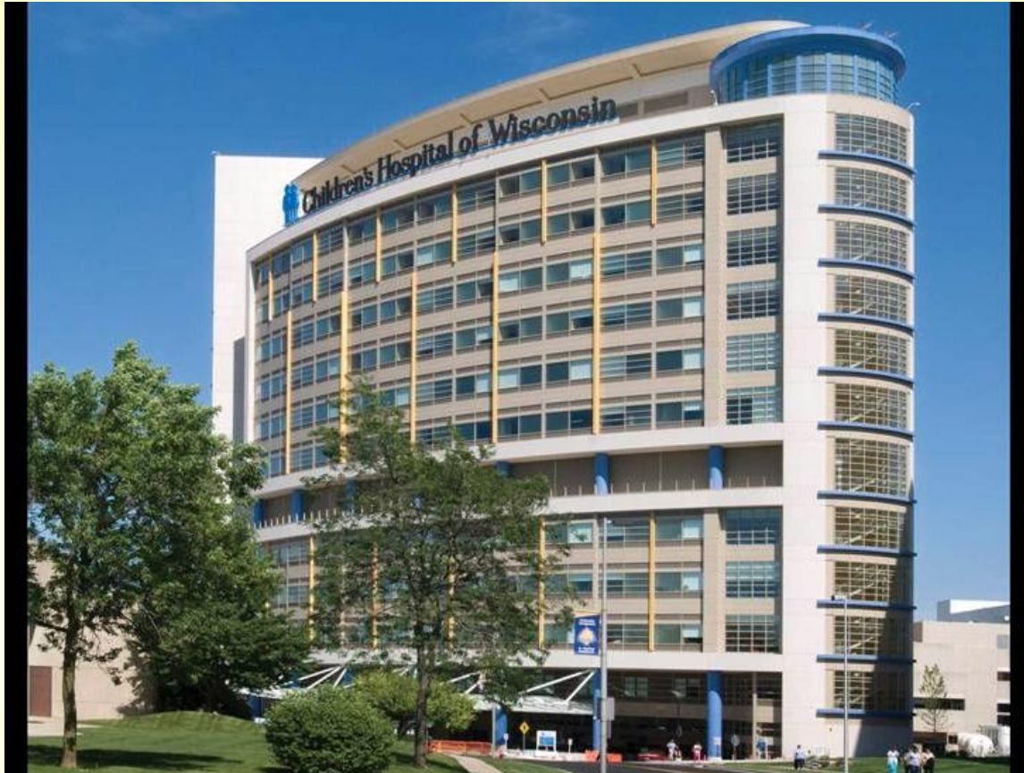
Wisconsin Poison Center